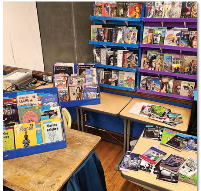
The Spanish literature library was supported by WHS Foundation mini-grants and offers diverse options in multiple genres so every student can select a book that matches their interest and increase their Spanish literacy.