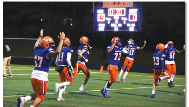
A great homecoming win for the Millers 29-0 against St Paul Highland Park