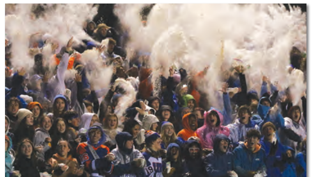
Despite the rain, a great turnout of Miller students who are participating in the new tradition of "Flour Power"

INSIDE: 2 Letter from the Principal & Washburn 100 3 Mini-grants 4-5 Athletics 6 Arts 7 Scholarships & Alumni 8 Donors