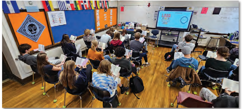
Students practicing Free Voluntary Reading (FVR) of books written Spanish in Prof Brener's Spanish class.

"Thank you for your consideration! I very much appreciate all you do for the Washburn community; your mini-grants make a difference for our students!"