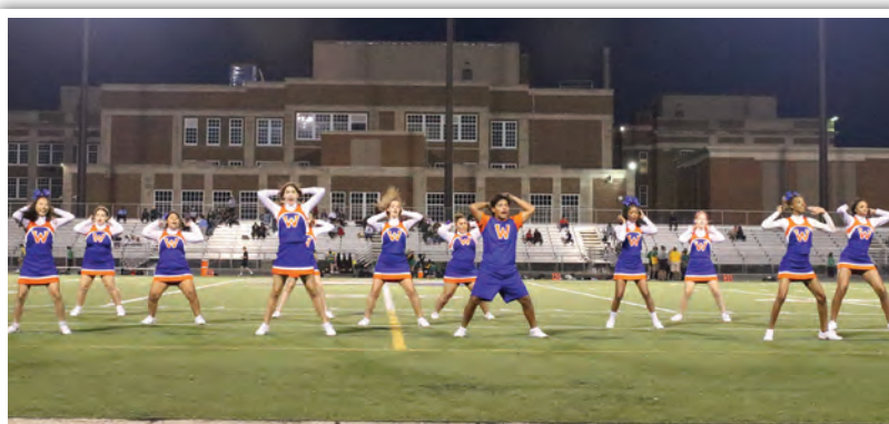
Here we go Millers, Here we go!