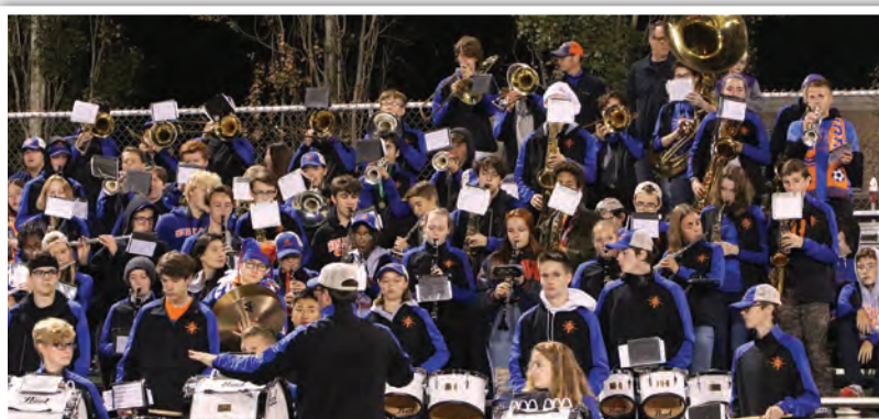
Alumni band members were invited to play with the current band at the game