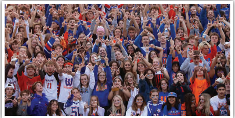
Washburn is home! Homecoming Pep Fest!

The WHS Foundation was not spared from the financial effects of COVID-19. Between our fiscal year 2020 and 2021 our fundraising fell 38% (or about $58,000). Given the Foundation's commitment (and past budgetary planning) to always increase our annual support for the school, the Foundation was able to INCREASE our budgeted support for WHS in fiscal year 2021 by 7% (or $5,000) in the midst of this fundraising decline. To do this, we used some of the Foundation's emergency cash reserves. We felt this was prudent given the unprecedented circumstances the school was experiencing over the past 2 academic years due to the pandemic. The Foundation's Board is very proud to have been able to step-up in a very trying time for the school. Our hope and plan is that our donors will help us to get our fiscal year 2022 fundraising back-on-track to pre-COVID levels.