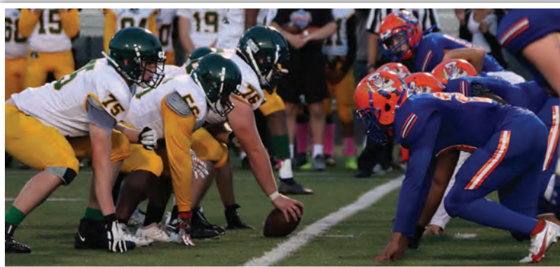
Although the loss to Park Center High School was a disappointment, WHS Homecoming 2021 was an amazing event all around!