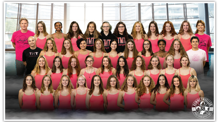
photoshopped from individual photos due to covid restrictions.