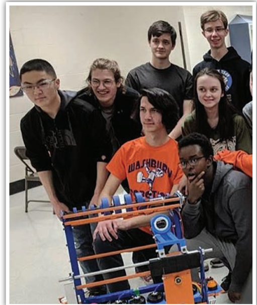
Members of the Washburn robotics team with their robot.