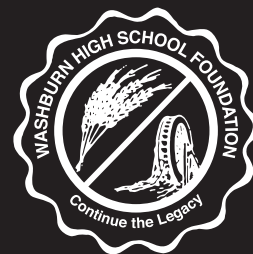
Washburn High School Enrollment