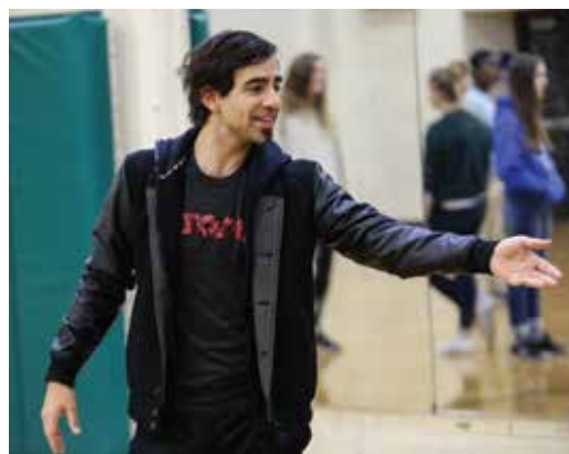
Washburn Dance Class

Washburn's fall musical was Zombie Prom. The musical, a mix of Grease and Rocky Horror Picture Show, was open to all freshmen, sophomores or anyone who had never performed in a Washburn musical before to open up the musical theater experience to more students.