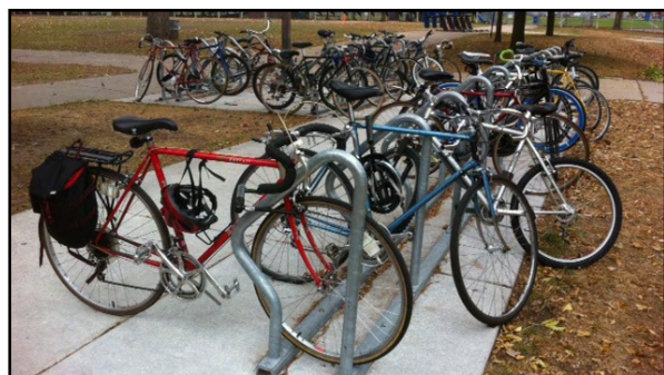
More evidence of growing community support at WHS.

Besides more students, what does this mean for Washburn right now and in the near future? All this growth, while exciting, undoubtedly puts more pressure on existing resources and facilities. Where public monies will fulfill some areas, private donations are needed for capital improvements, advanced curriculum, leadership development tools, classroom speakers, and more. Your donation will help make this growth sustainable.